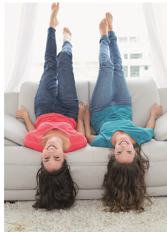
energear™ can have a positive effect on the body and its energy balance