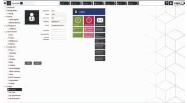
My Profile Section

With RayFlow, customers shop a very high level of transparency, which allows for an exact and comprehensive tracking of each and every task. This feature does not only support easy coping with everyday workload within a project, but at the same time provides the level of overview managers need to ensure a successful project progress.