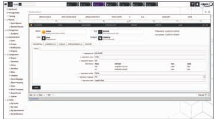
New User Interface

RayFlow is knowingly aligned for maximal flexibility in order to be able to grow beyond the origins of packaging factory process management, and to adapt behavior and control structures for the needs of any business process. The real stunt is not the provision of flexibility itself, but rather embedding it into a user interface that convinces operators and administrators likewise, and allows them to interact intuitively. This is a trick RayFlow 2.0 performs outstandingly.