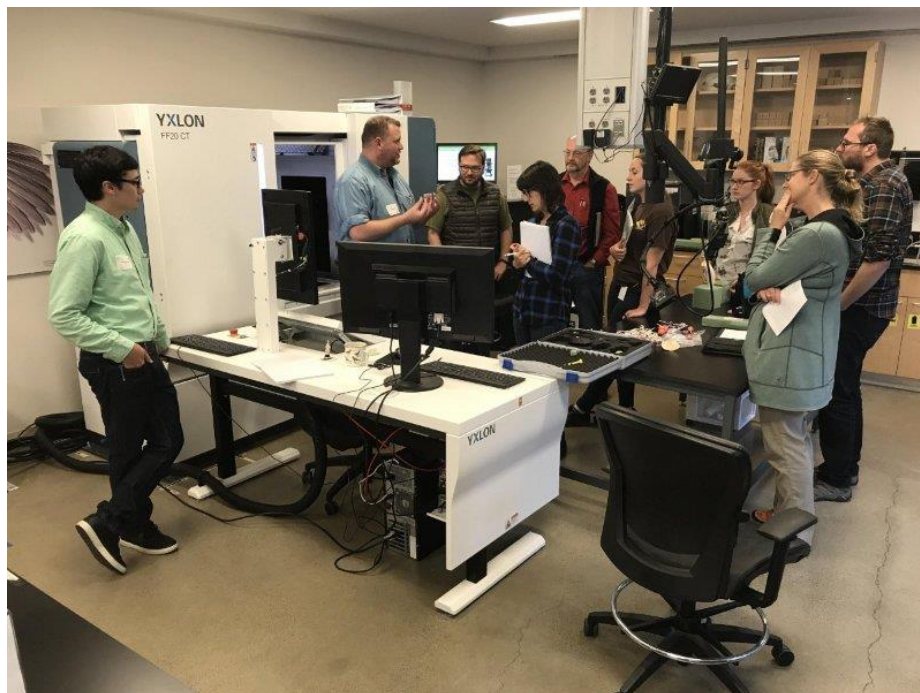
Training Workshop in the Cal Academy Project Lab showing the ease of use of the YXLON FF20 CT system

The non-destructive nature of CT imaging technology allows for a 3 dimensional look into a myriad of industrial, biological, and historical samples and artifacts. The FF20 CT is a compact industrial CT system that is helping scientists uncover critical information about how the some 46 million specimens housed at the institute function and interrelate in nature.