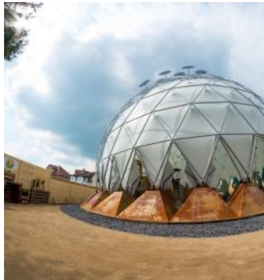
Picture 2: Thüringer "Climate Pavilion" with OPV installation in the form of solar umbrellas