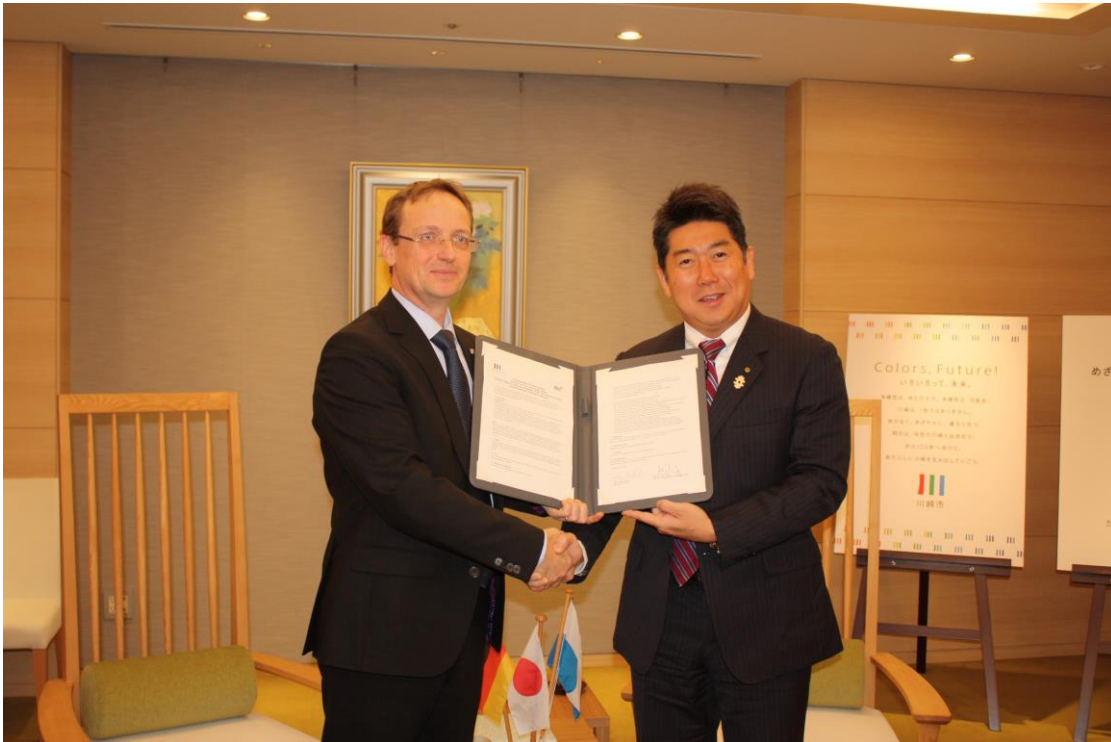
Photo during the signing of the MoU by Mr. Fukuda, the Mayor of Kawasaki