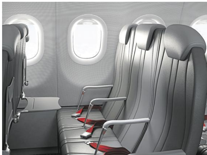
Expliseat Titanium Seat: real prototypes

For more information about ESI's Virtual Seat Solution, please visit http://www.esi-group.com/virtalseat