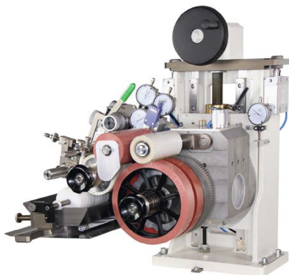
„RTI 21-150“ Built-in rotary tampon printing unit