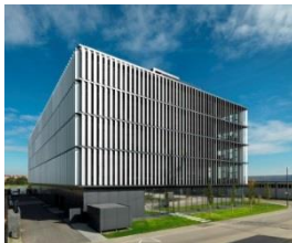
BFFT-Headquarters in Gaimersheim near Ingolstadt.