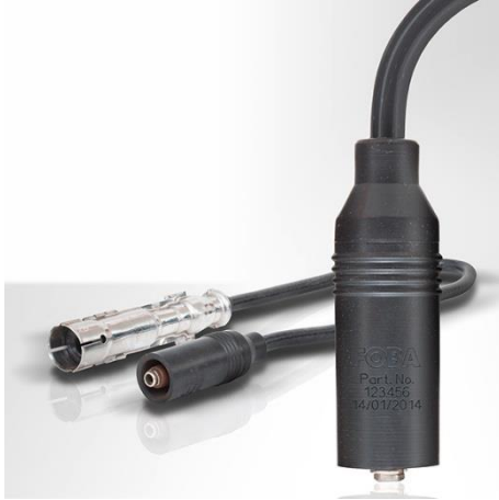
Ignition distributor with laser marks