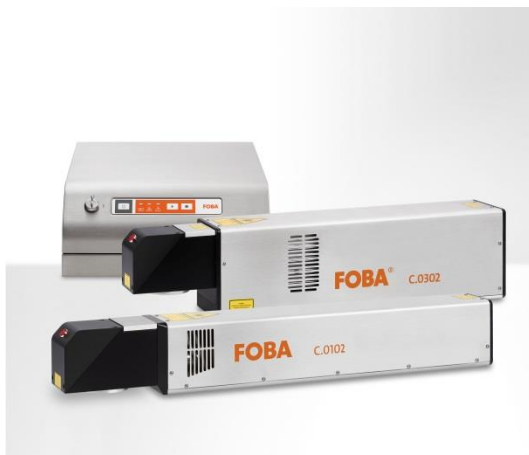
FOBA C.0102 and C.0302, 10- and 30-Watt-CO2-laser marking systems of the latest generation, offering a wide range of marking solutions for different materials and contents.