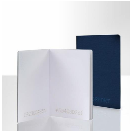
Laser marking on paper and card board: passports