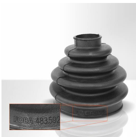
Plastic auto cuffs, laser marked