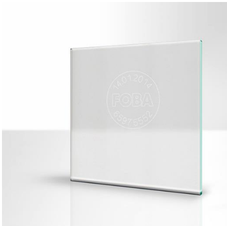
Window glass, laser marked