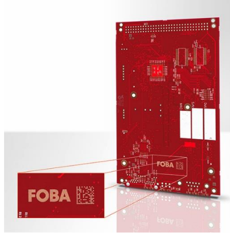
PC-board/printed circuit board