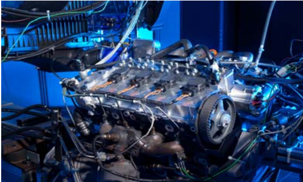
Test rig motor with KSPG's variable valve train "Univalve"