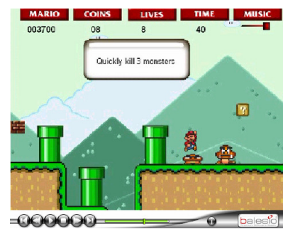
3 EXPORT & PUBLISH

ALLCapture lets you customize your capture, for instance frame rates or multiple screens. You can record sound and voice over during game capture. Also, you can re-record, add multiple sound layers for a more complete experience. The software offers a wide range of editing possibilities, including highlight, zoom, animation, image import and special effects. The intuitive timeline makes the editing process spectacularly easy. Videos can be exported to popular Internet formats, including Flash and MPEG, for further upload to iPods or platforms such as YouTube, GameVee, 1UP etc.