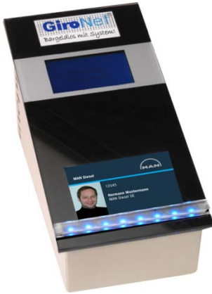
1 Reader for cashless payment