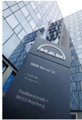
2 MAN Diesel's HQ in Augsburg/Germany