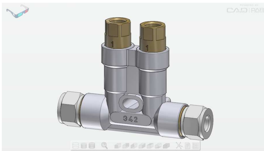
Caption 2: 3D CAD models of the MonoFlex single-line distributors from SKF Lubrication are now available to download. More will follow.