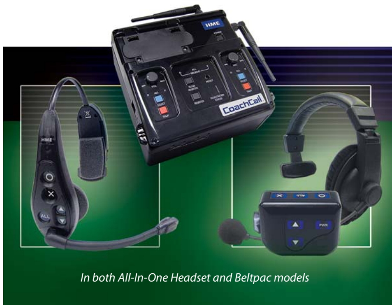
In both All-In-One Headset and Beltpac models

The basic CoachCall five-coach system includes five headsets, three belt-pacs, a belt-pac battery charger, a base station and a carrying case.