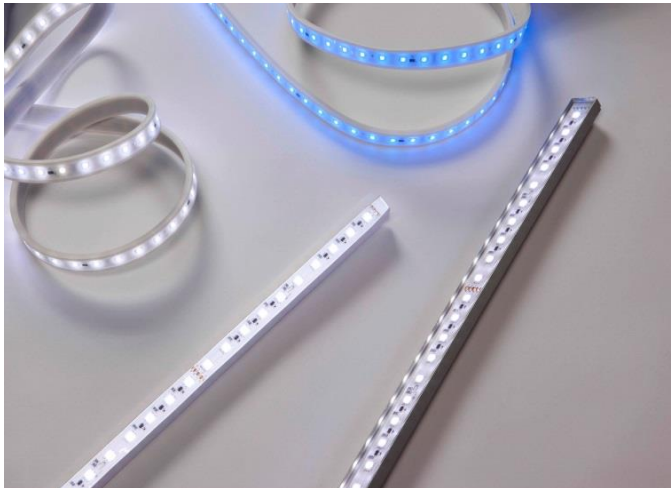
Potting systems from Sonderhoff for optimal LED encapsulation