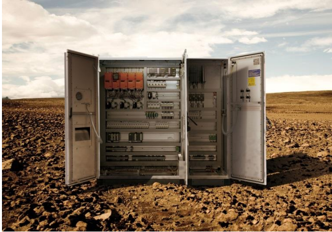
Fast-Cure foam seals from Sonderhoff for the electronic industry