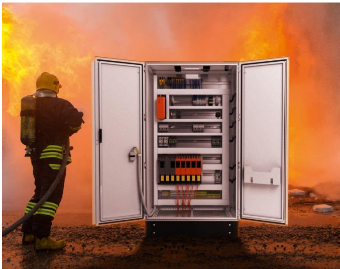
New switch cabinet foam seal from Sonderhoff with UL94 HF1 flame protection