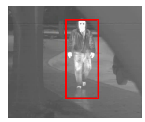
Detection, tracking and zoom on intrusion