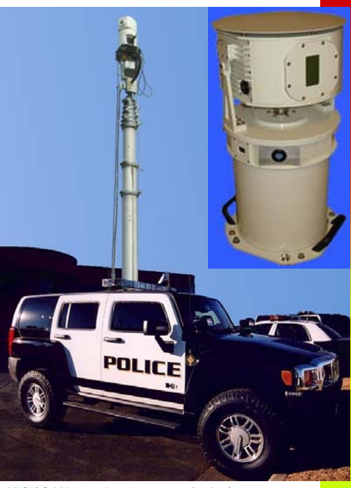
VIGISCAN rotating sensor and platform