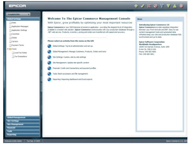
Intuitive, easy-to-use, administrative control panel.