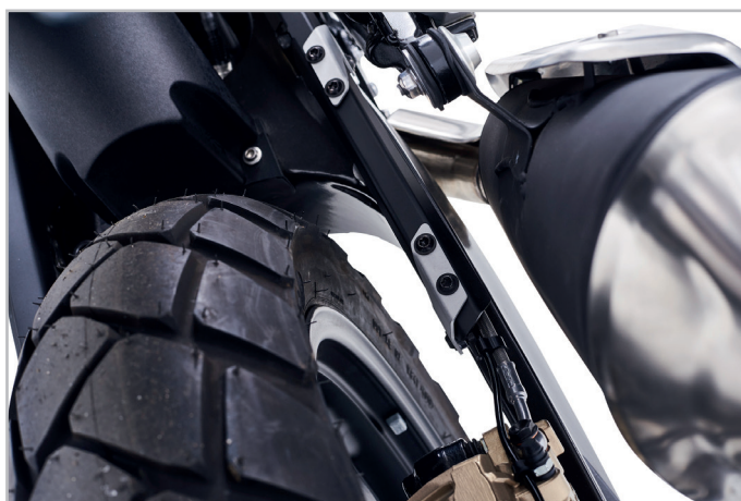
Wunderlich Brake Line Protector (Rear)

Please find further images on the next page