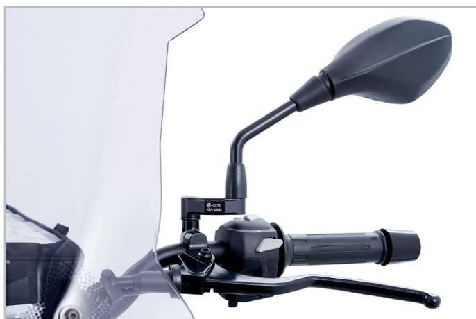
Wunderlich ERGO Mirror Extension