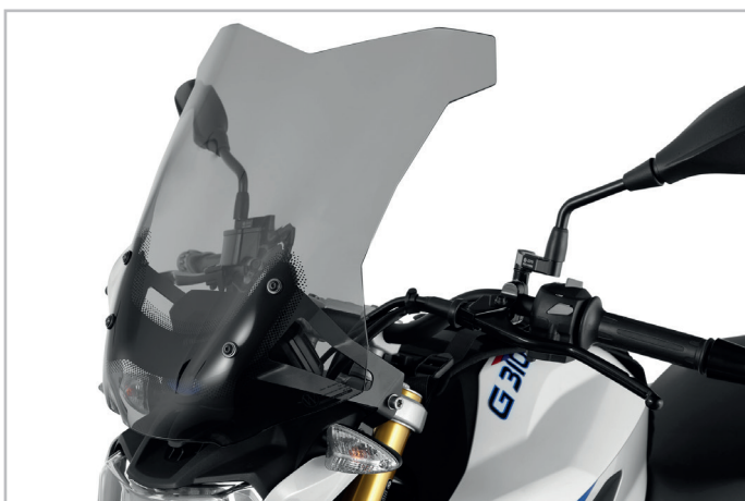
Wunderlich Windscreen Touring