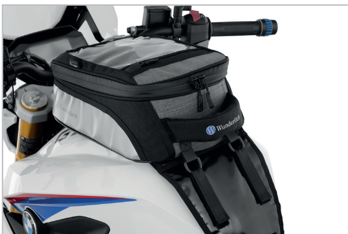
Wunderlich Tank Bag Tour