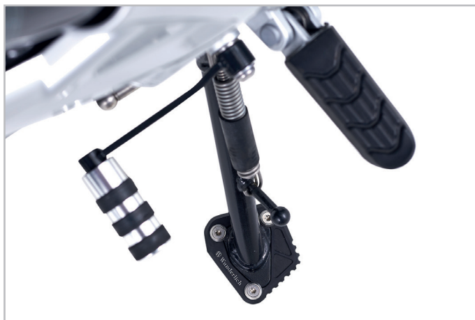
Wunderlich Side Stand Enlarger

Please find further images on the next page