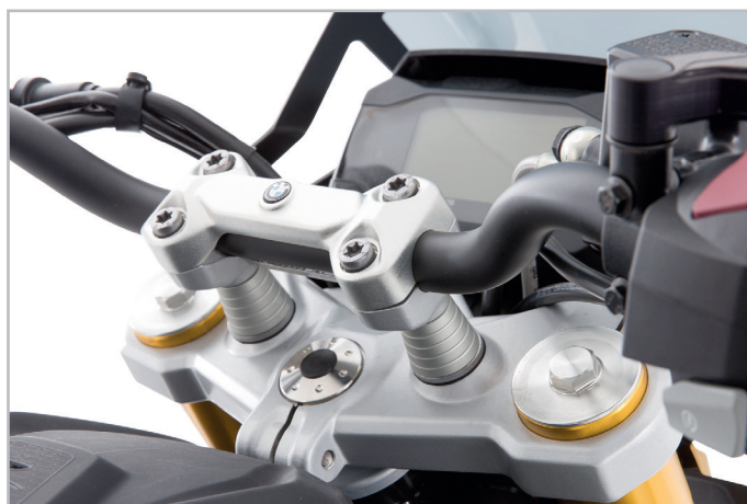
Wunderlich Handlebar Riser

Please find further images on the next page