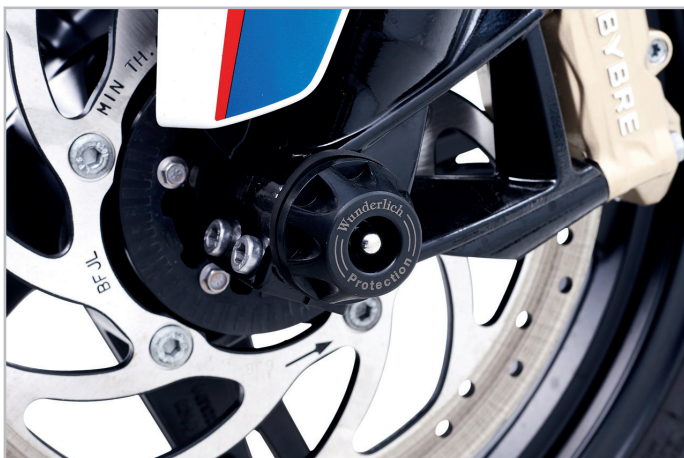
Wunderlich Crash Protector