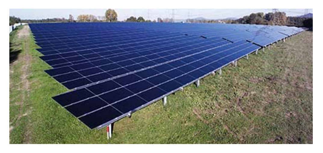
Large scale plant wired with photovoltaic array harnesses from Lumberg