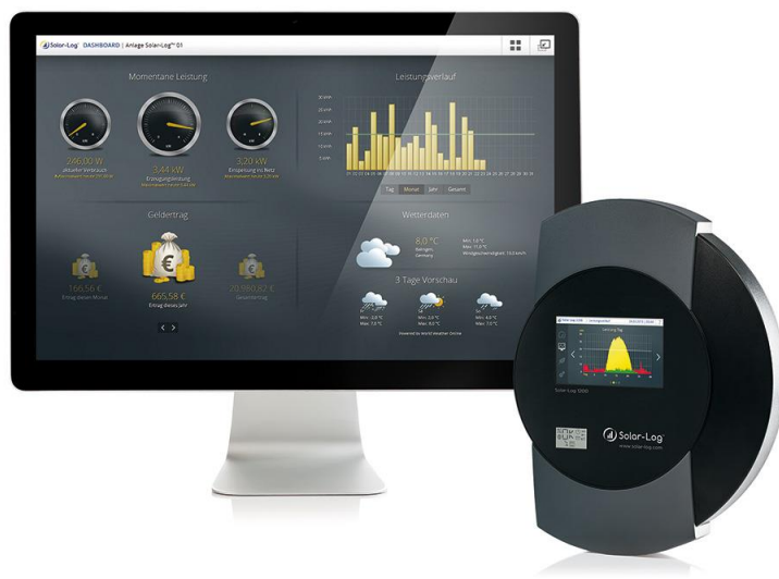
Solar-Log™ Dashboard + Data Logger