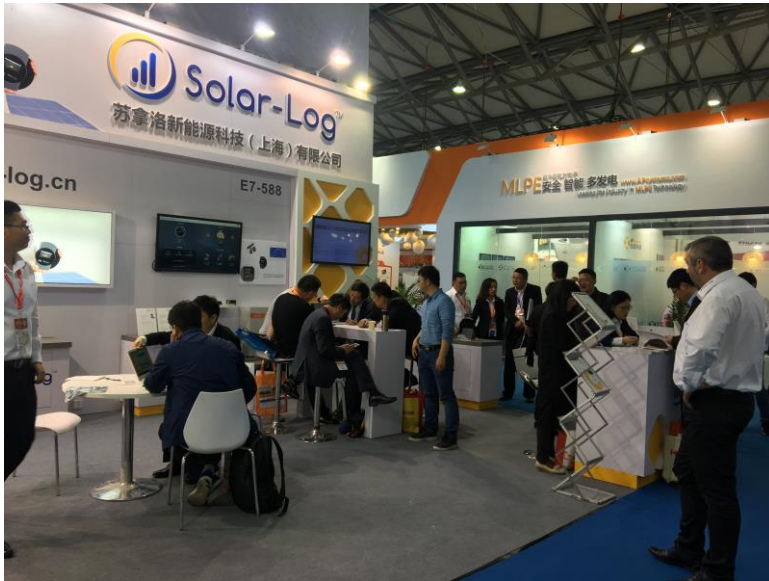
Many visitors came to the Solar-Log™ stand