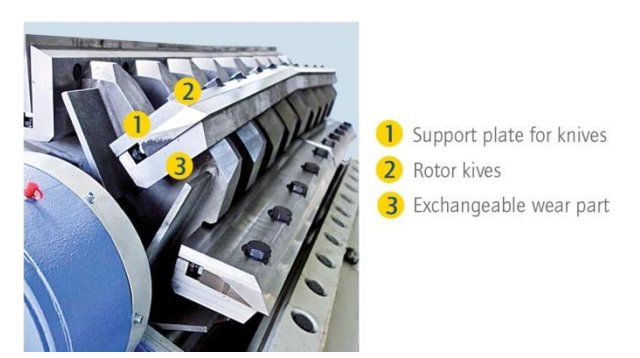
Fig. 4) Rotor of the F Series with exchangeable wear protection

The one-piece rotor guarantees stability. Welding seams cannot break since they do not exist. The knives of this rotor cannot shift because they are crewed onto a massive back limit stop. This special design facilitates cleansing for there are no "dead angles" where remnants of grinding material could deposit.