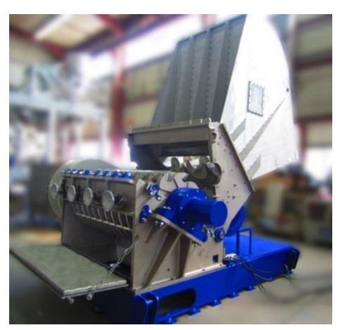
Fig.3) Herbold Granulators SB with forced feeding

The patented Herbold granulators with forced feeding of the SB type have been successfully in operation worldwide for many years now. The material is not fed into the grinding chamber by gravity as is the case with traditional granulators but as a continuous and even flow by means of feeding screws.