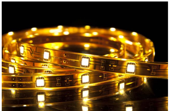
(3): The clear potting systems from the Fermadur® product family are used for transparent or optically attractive applications.