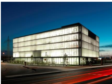
Illuminated BFFT-Headquarters at night.