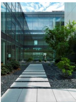
Atrium in the BFFT-Headquarters.