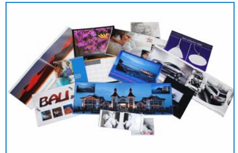
purePhoto books and calendars

Unfortunately, photo albums ordered online normally have a picture quality that is far below the possibilities offered by modern technology. The fault lies primarily with the use of