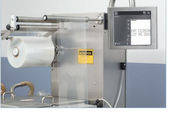
Please touch! ALLTEC's new touch-screen operator interface SOI – attached to a packaging machine

SOI touch-screen on a stand with the ALLTEC LC300 laser marker