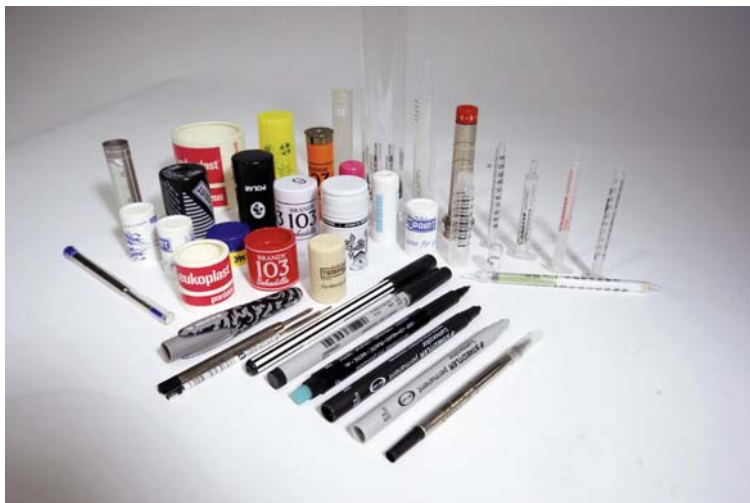
Samples printed in TAMPOPRINT® rotary printing process