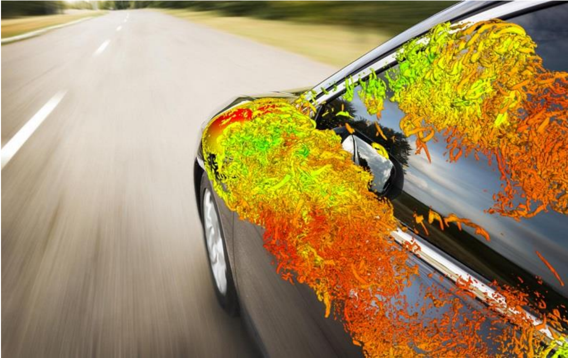
Image: Fluctuating surface pressures on the side glass of the car calculated using OpenFOAM® open source CFD code . Complex, fluctuating surface pressure data can be imported into VA One from nearly any commercial CFD code.