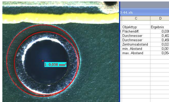
2-circle difference: 7 mouse clicks – 6 measured data