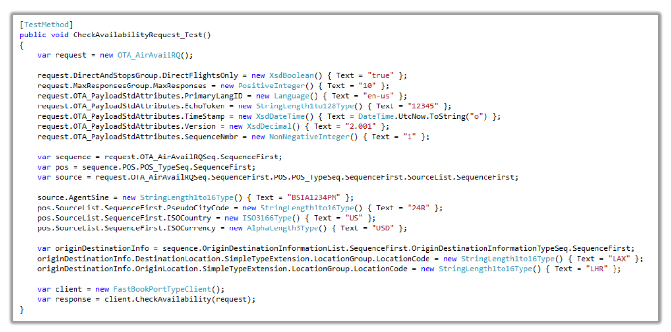
Figure 12 Client-side implementation of the web service example