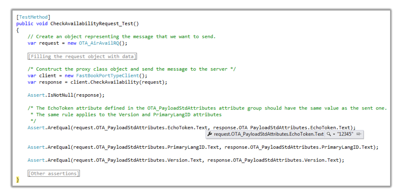
Figure 14 Result of running the web service with a debugger attached

Running the unit test proves that the communication between the client (which uses JMT Type Library and a proxy class generated by the JMT Extension) and the server (that uses any technology) works. You may see how the response returned by the server was deserialized and mapped to corresponding schema type from JMT Type Library: