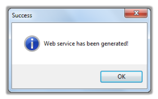
Figure 7 Information window after successful code generation

Click the Generate web service button. A confirmation dialog is displayed indicating that the web service client code has been successfully generated.