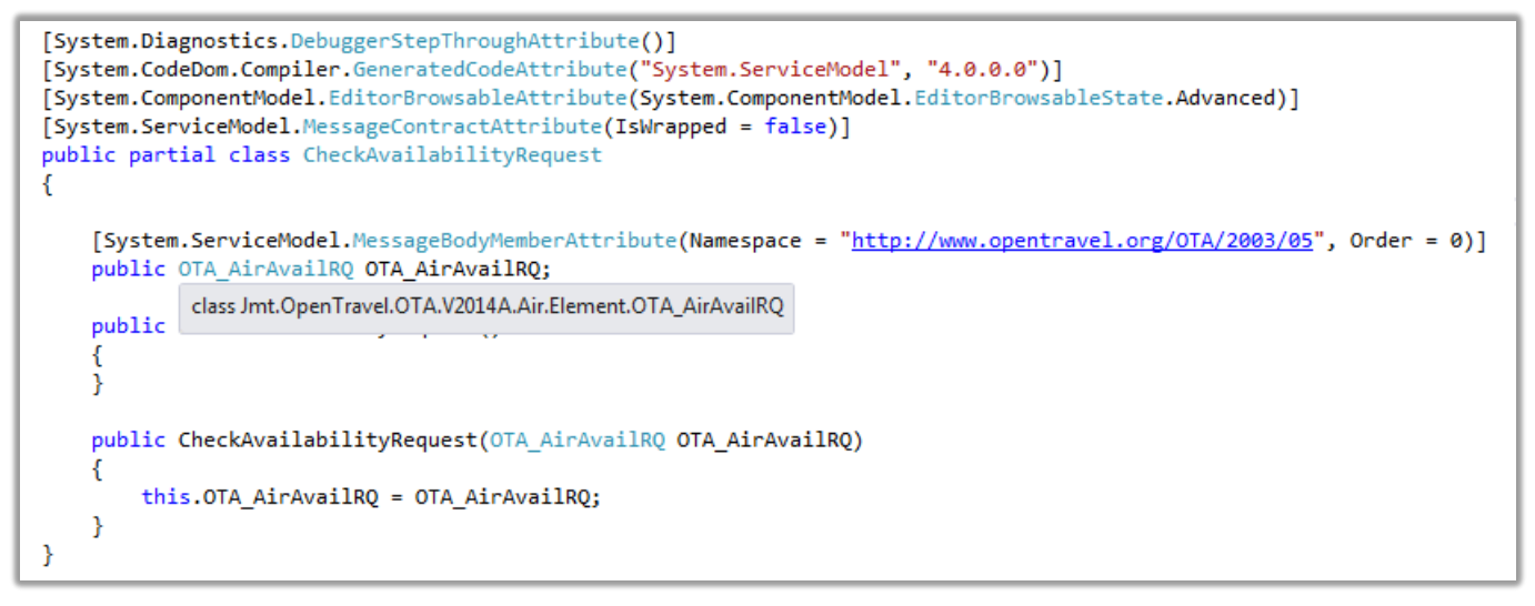
Figure 9 Generated message contract class (fragment)

Taking a closer look at one of the message contract classes (CheckAvailabilityRequest) Figure 9,